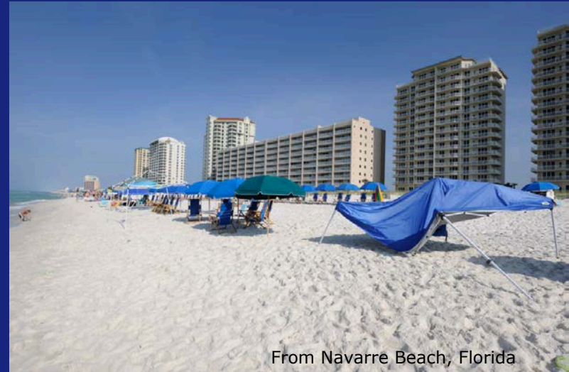
From Navarre Beach, Florida