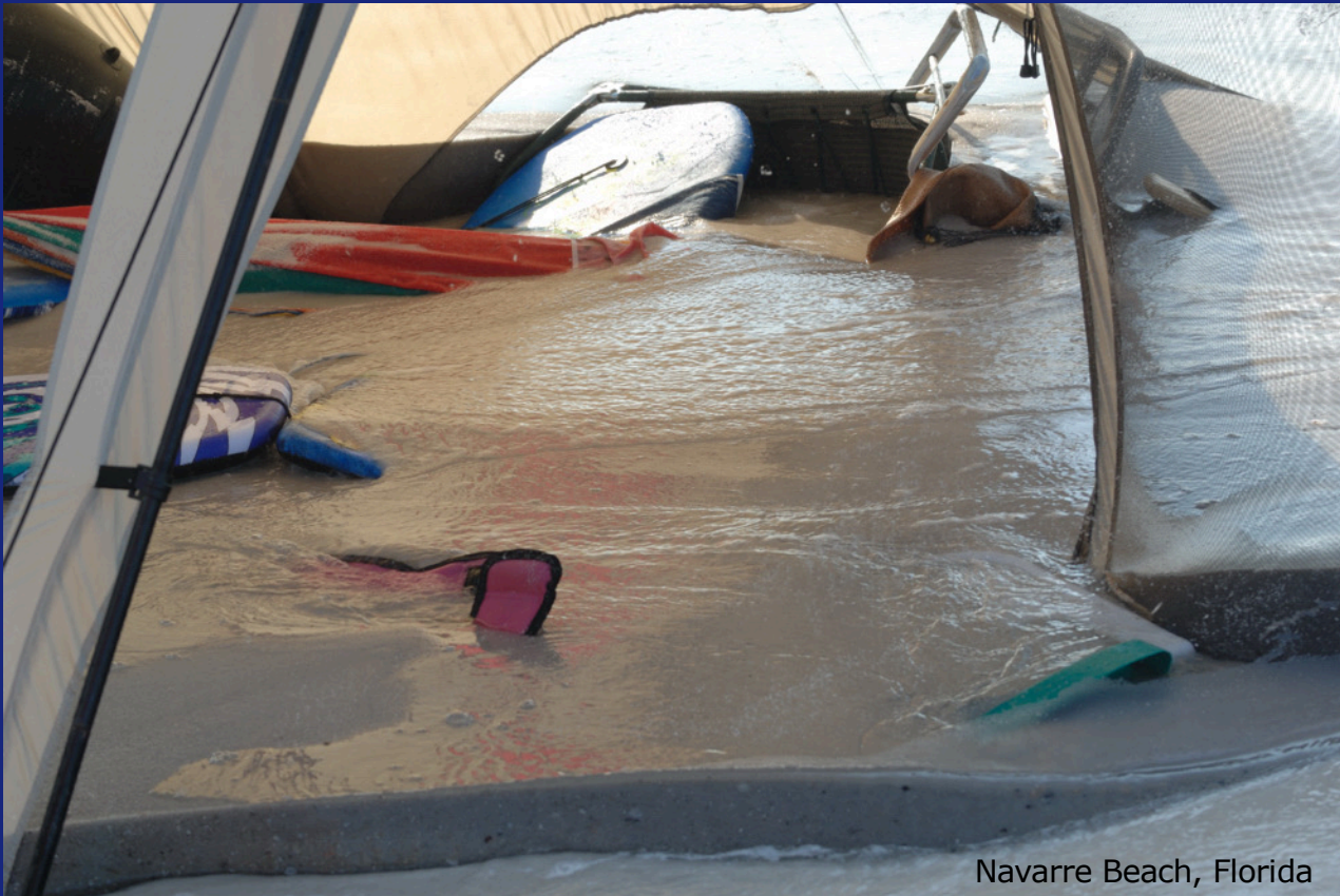
Navarre Beach, Florida